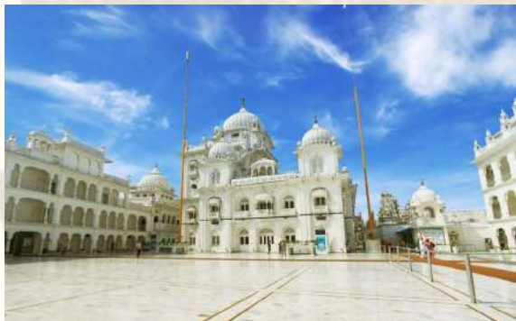
Patna Sahib Gurudwara